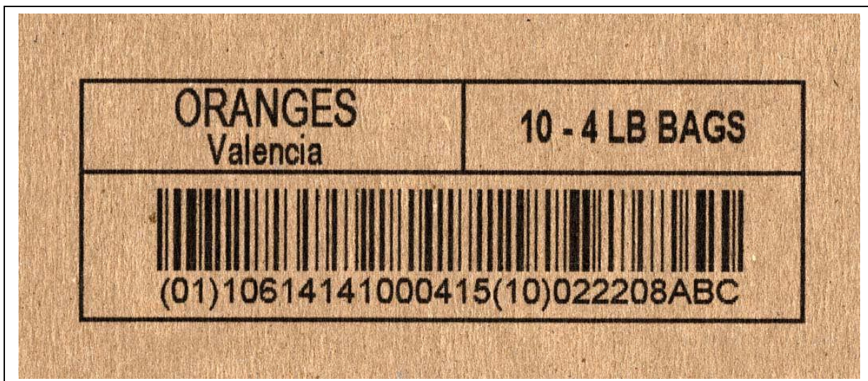
ProSeries 384 Print with 22 mil barcode