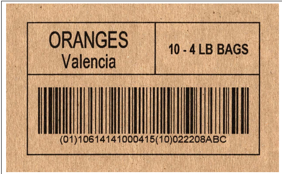
ProSeries 768 Print with 29 mil barcode